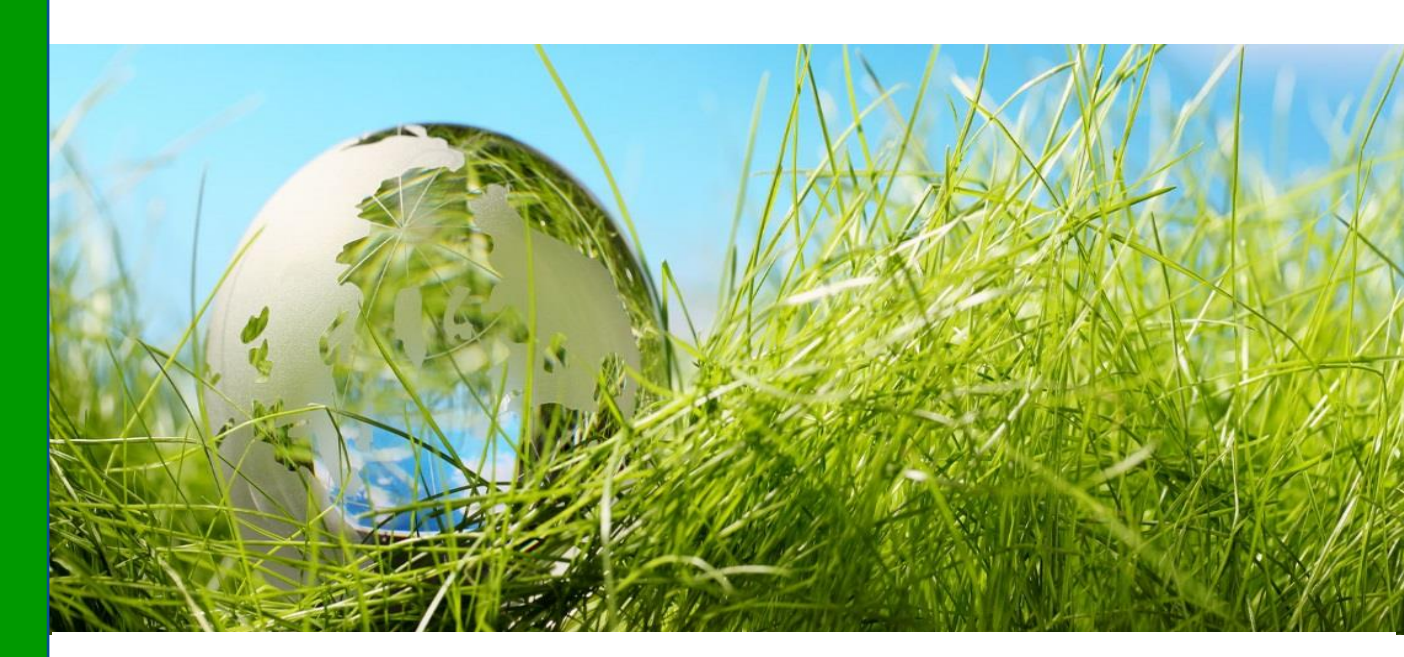
Environmental Consultants, Engineers, Designers Turnkey Project Executors with Environmental Pollutant Monitoring and Testing, Energy Auditors